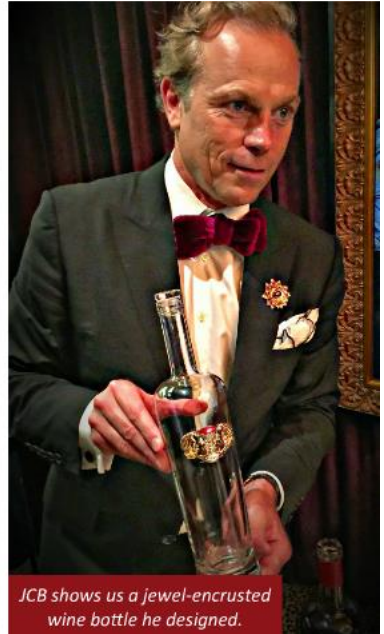
JCB shows us a jewel-encrusted wine bottle he designed.