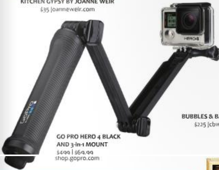
GO PRO HERO 4 BLACK AND 3-IN-1 MOUNT $499 | $69.99 shop.gopro.com