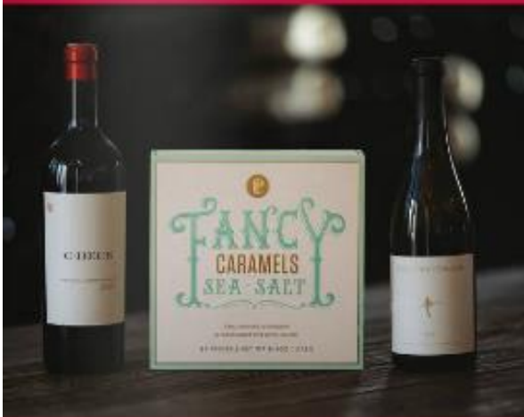
WINTER WONDERLAND GIFT SET $160 klazwinecollection.com