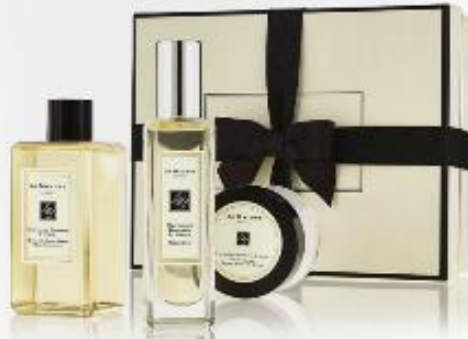
JO MALONE LONDON NECTARINE & HONEY COLLECTION $110 neimanmarcus.com