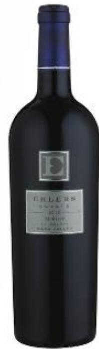
2012 EHLERS ESTATE MERLOT $65 ehlersestate.com