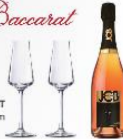
BUBBLES & BACCARAT $225 jcbwines.com