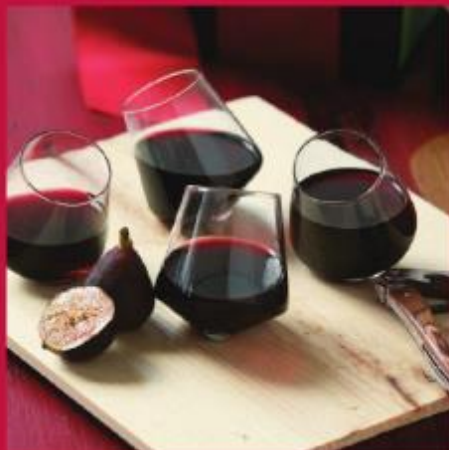
OLIVE & COCOA LITTLE TOSPY SPIN GLASSES $98 oliveandcocoa.com