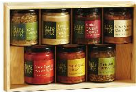
EXCLUSIVE ULTIMO SPREAD GIFT SET $69 napastyle.com