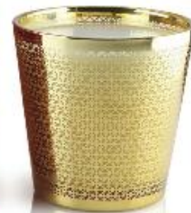
NEST HOLIDAY GRAND CANDLE $225, neimanmarcus.com