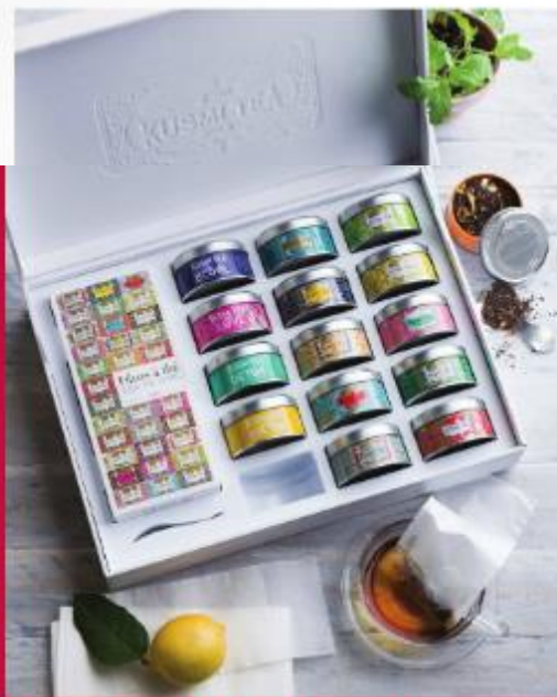
KUZMI TEA COLLECTION GIFT SET $199 nelmanmarcus.com