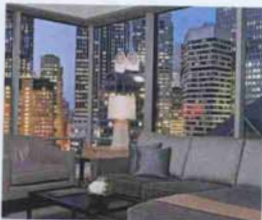
Above: Live like a tech titan at The Battery Left: City views from The St. Regis San Francisco Right: The billiard room in the Fairmont Hotel's Penthouse Suite