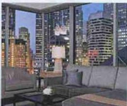
Above: Live like a tech titan at The Battery Left: City views from The St. Regis San Francisco Right: The billiard room in the Fairmont Hotel's Parlorhouse Suite