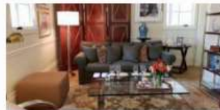
A homey tasting room, outfitted by Ralph Lauren Home, at Silver Trident Winery.

Since tasting rooms are within city limits and not in the open vineyard stretches along 29 and the Silverado Trail, they are simply storefronts along the street. But given the city's ordinance that 25% of the space has to be turned over for retail, they're hardly typical environments. Silver Trident Winery , located within a stone Tuscan inspired cottage, is furnished as an extremely tasteful home—living room, dining room and library—decorated with Ralph Lauren Home furniture and furnishings all available for sale. (It even has a friendly family dog named Keith Richards.) Handwritten Wines , which specializes in cabernets, is also furnished as an intimate dining room.