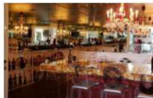
The elaborate, gold leaf filled tasting room at JCB Tasting Salon.